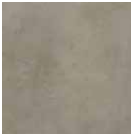
832 River Rock