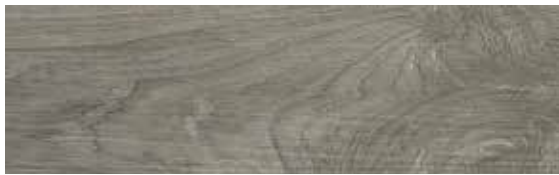
936 Converse Basin