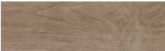
142 Kew Gardens