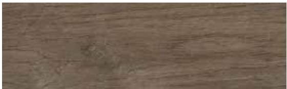
148 Atwell Mill