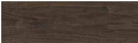
872 Picton Park