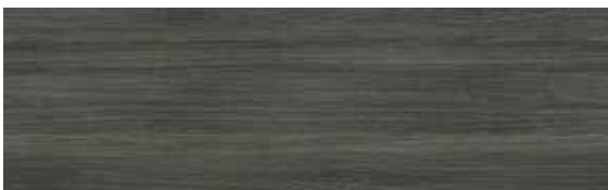
946 Open Canyon