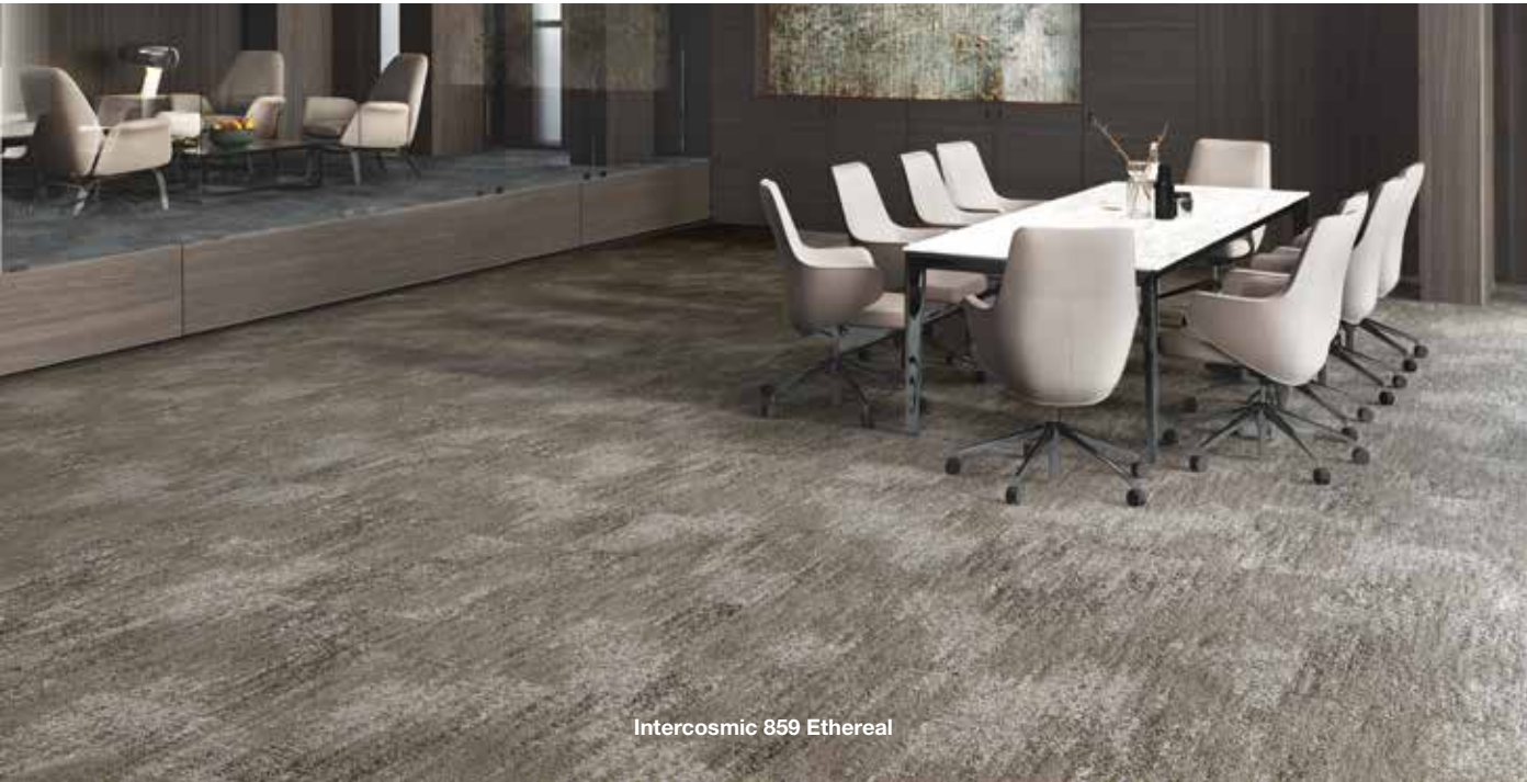
Intercosmic 859 Ethereal