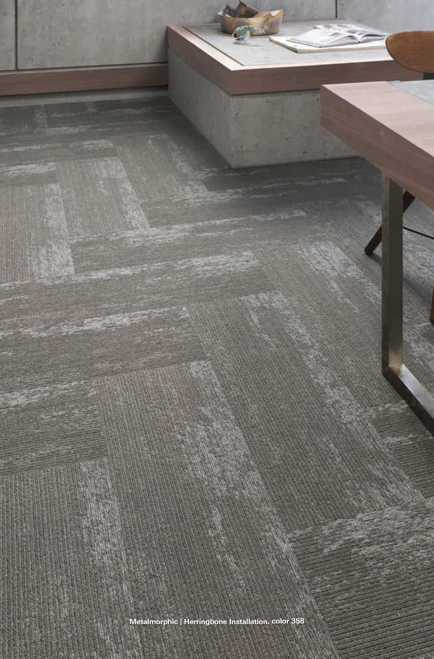
Metalmorphic | Herringbone Installation, color 358