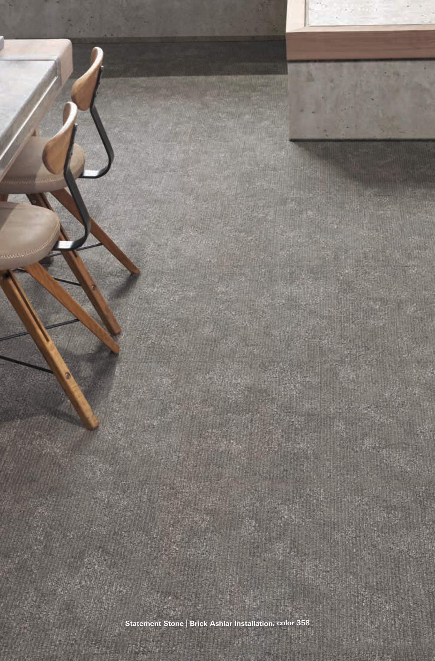
Statement Stone | Brick Ashlar Installation, color 358