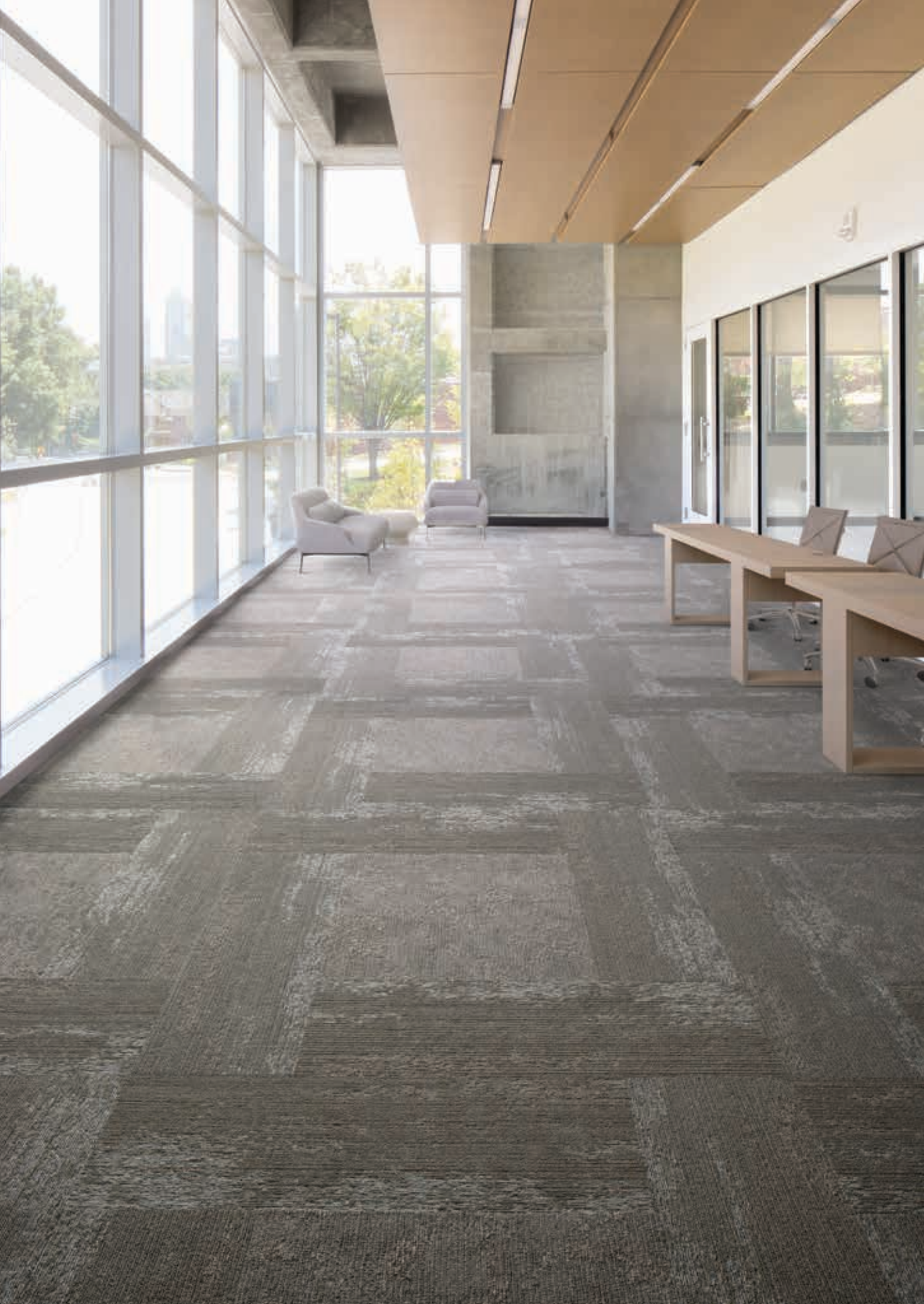
Metalmorphic, color 358 combined with Statement Stone, color 358