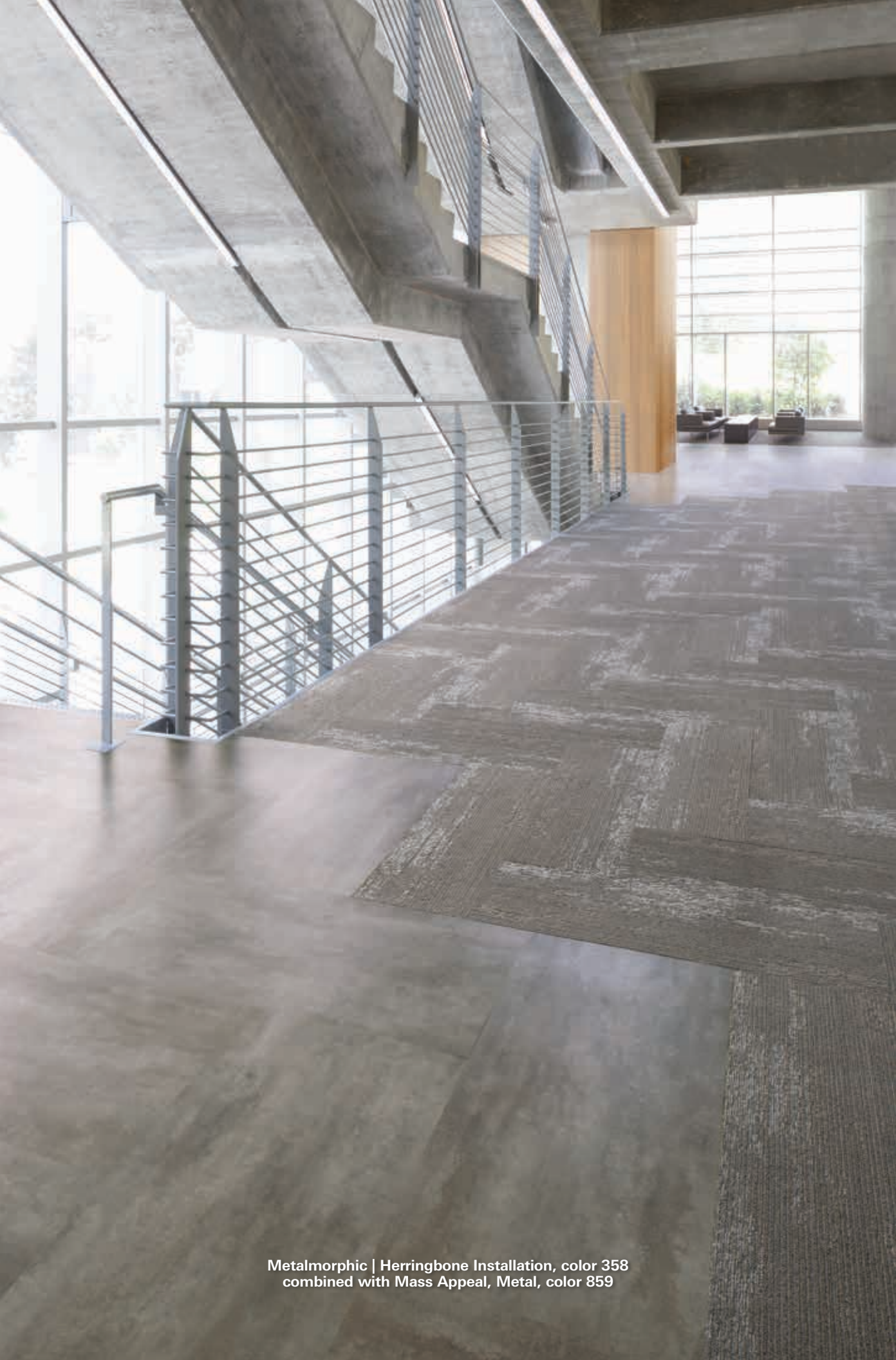
Metalmorphic | Herringbone Installation, color 358 combined with Mass Appeal, Metal, color 859