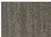
358 Classic Ridge Quickship Available