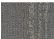
955 Solid Ground Quickship Available