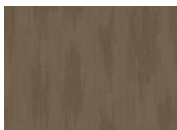
152 Living Fast Quickship Available