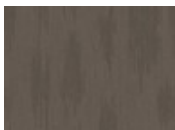
358 Thrill Seeker Quickship Available