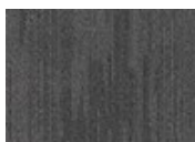
999 Leather Jacket Quickship Available