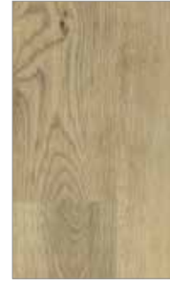
540 RIVER OAK