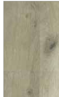
710 FROSTED OAK