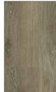
720 SUMMIT OAK