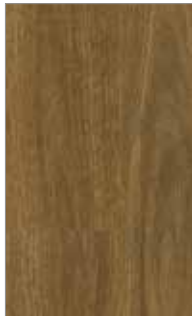
555 SPOTTED GUM