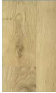
300 AUTUMN OAK