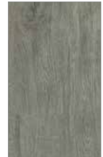
750 CARBONISED OAK