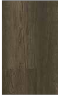
180 FUMED OAK