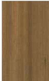
655 FOREST REDS