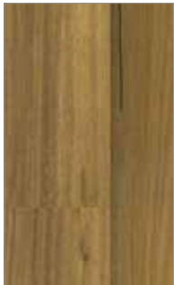
550 WESTERN TALLOWOOD